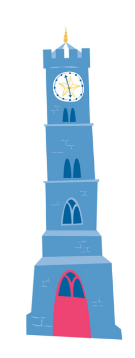
Engagement Committee Monday 5th February

Meetings to be held on the 3rd Monday of the month (If available) by request